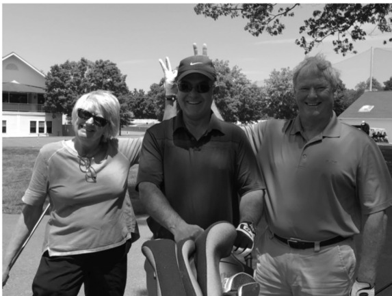
The golf outing on June 23rd was enjoyed by all the participants!