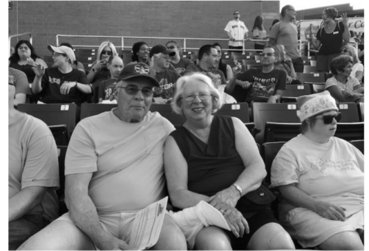
It was a beautiful night for a ballgame at the Lowell Spinners August 2nd.