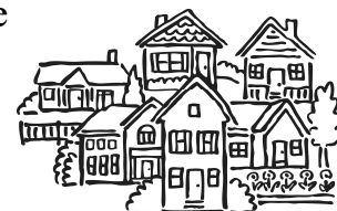
Who Is My Neighbor?