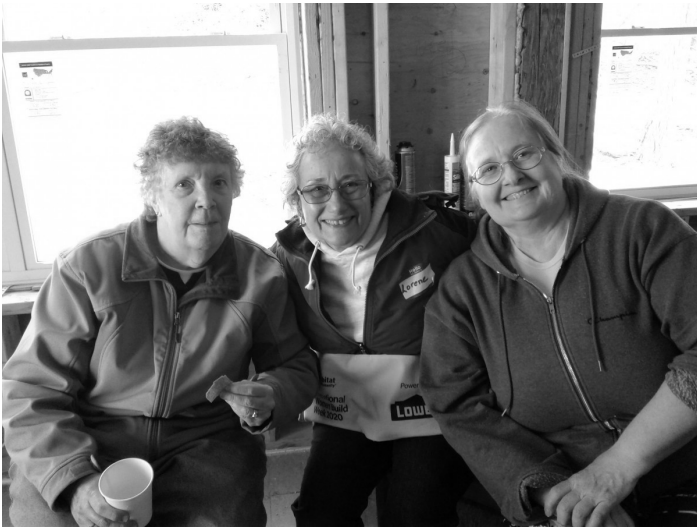
Missions brought lunch to the Habitat for Humanity build in Andover on March 7th. Thanks to those who made the sandwiches!