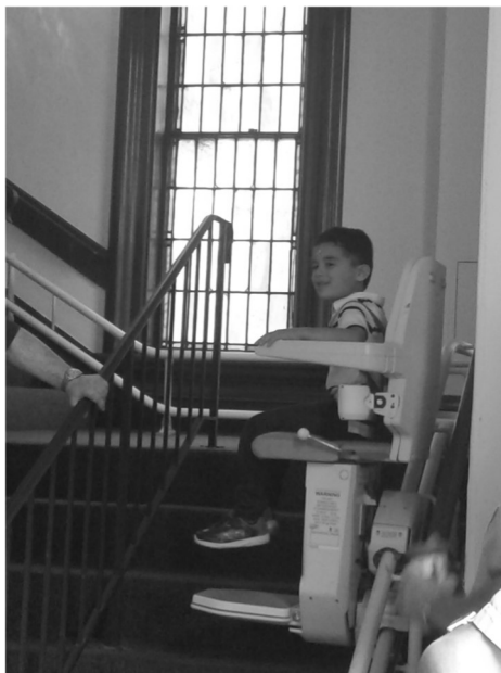
If you take a picture at an event, forward the file to the office and we'll use it in the newsletter!

We had some maintenance done on our chair lift and now it's a lot more fun to ride!