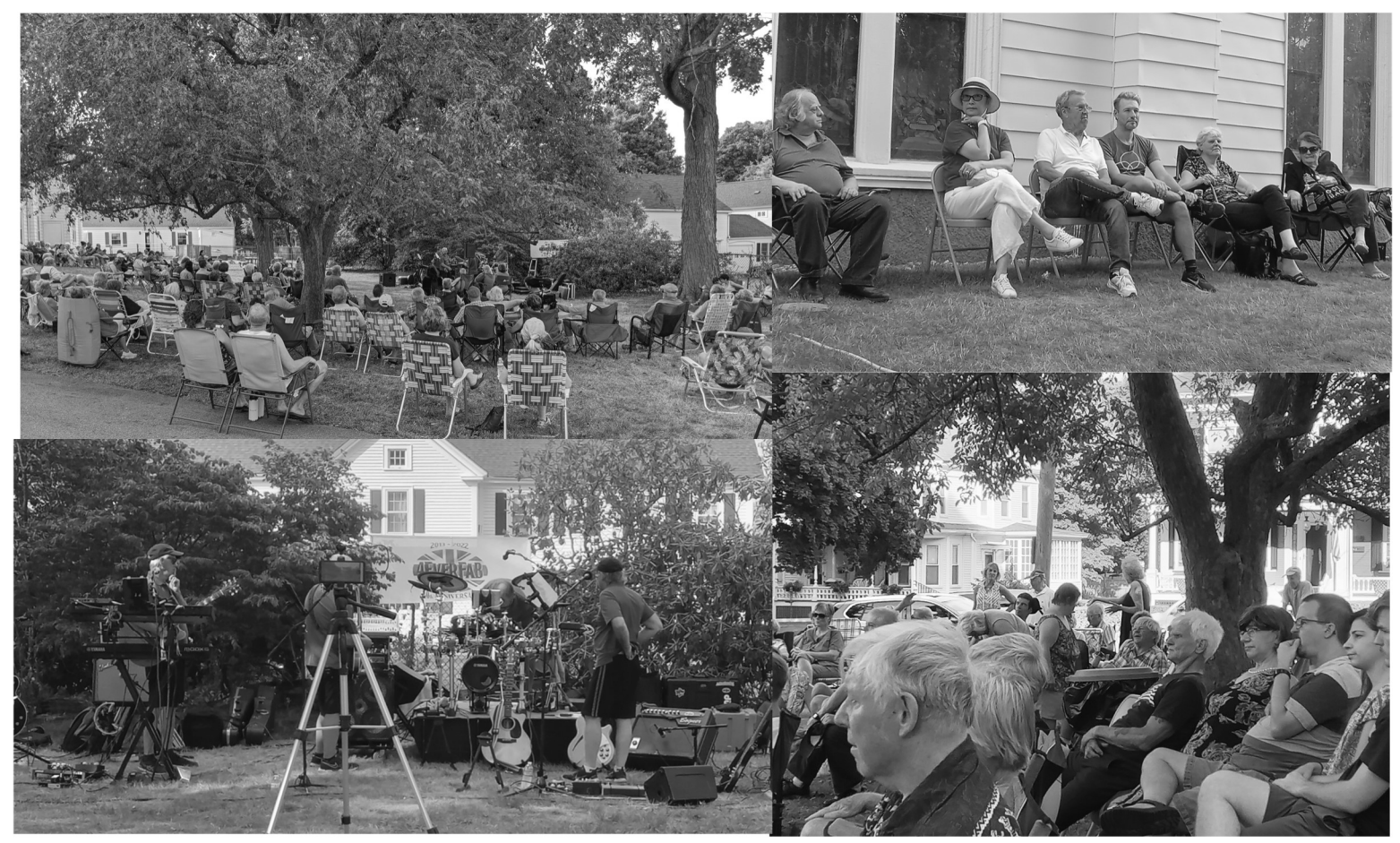
September 11—12Barz Band